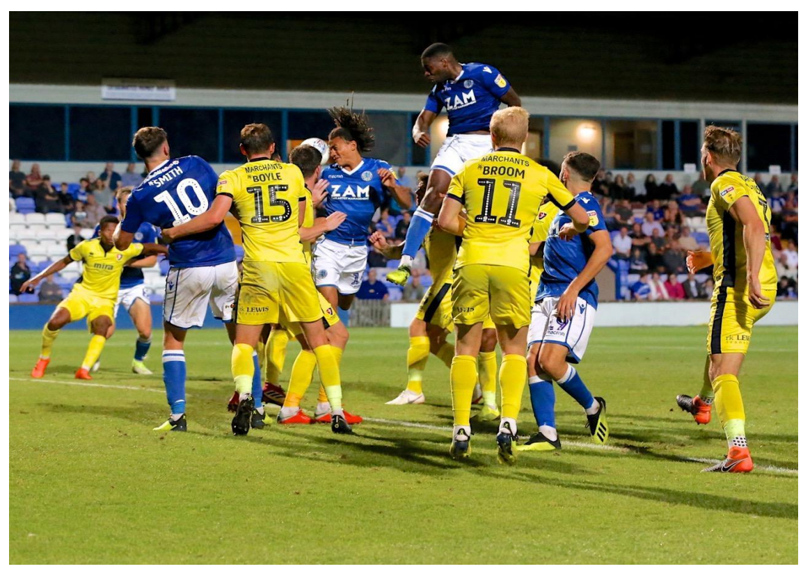
Match action in the home match against Cheltenham Town