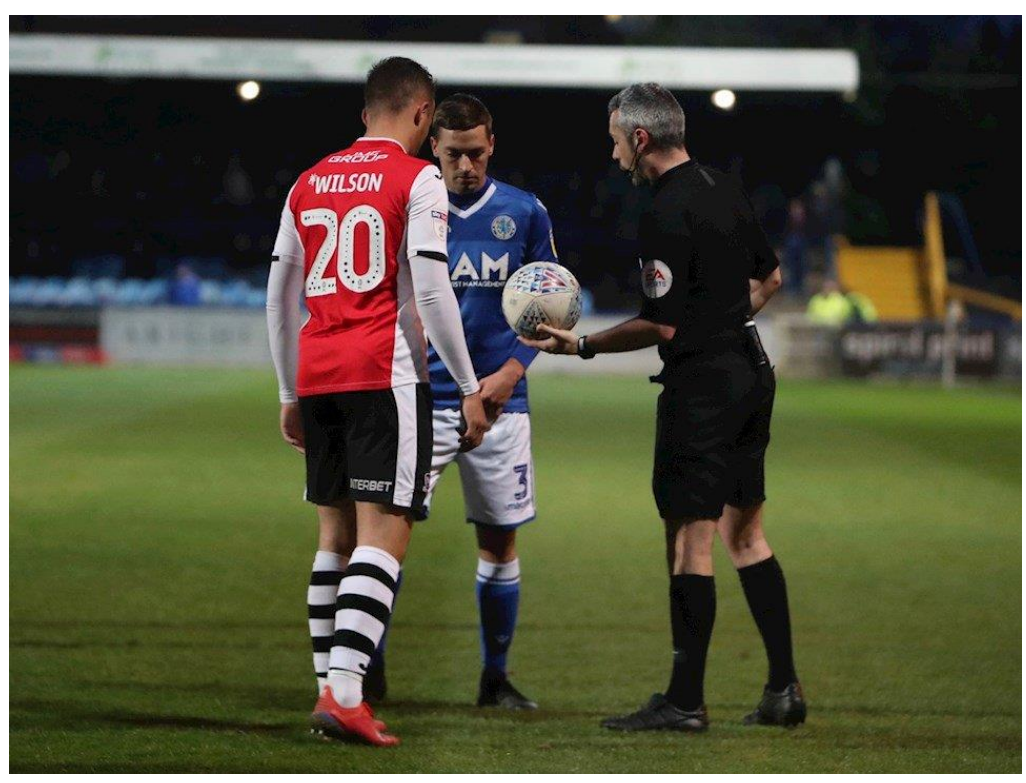
A contested drop ball during the match against Exeter City