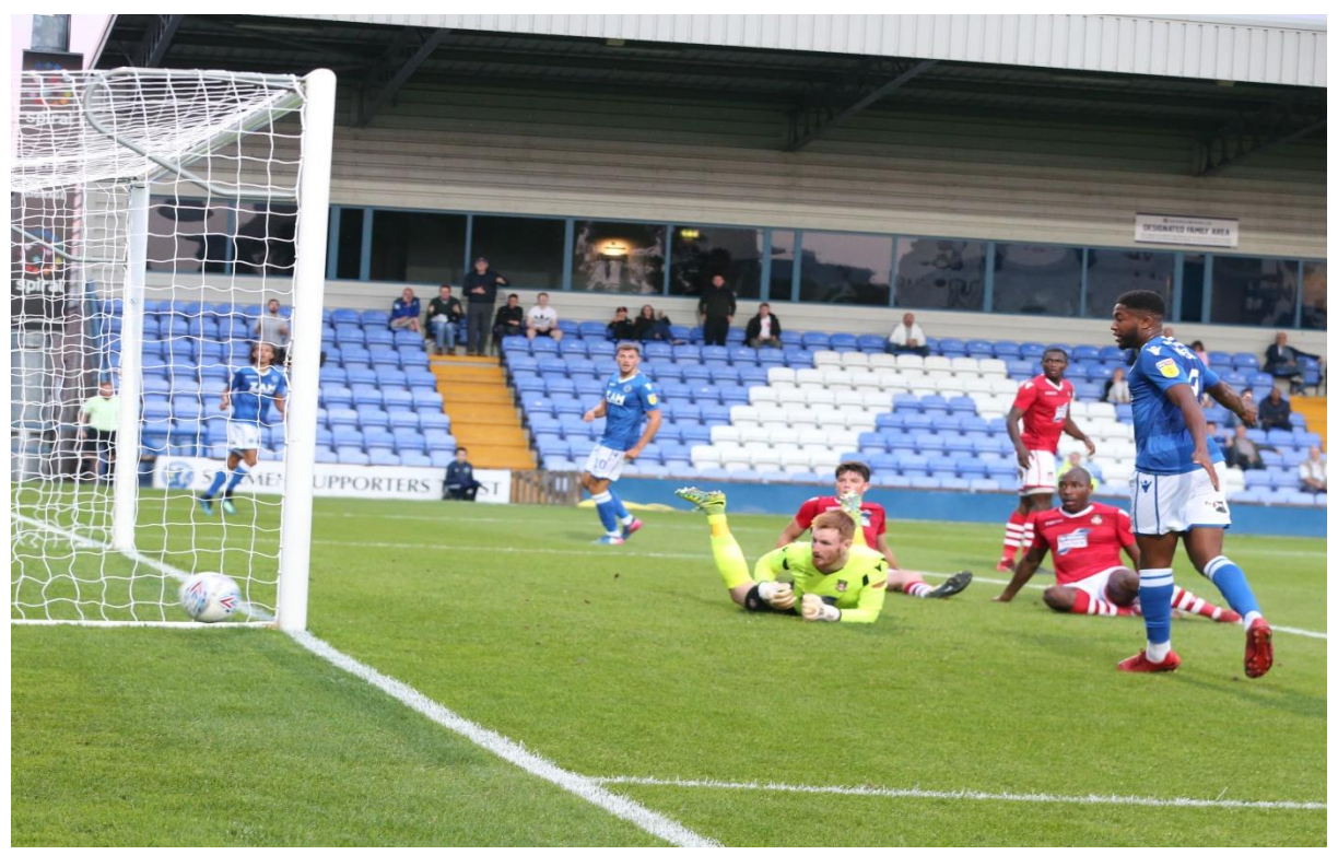
Goal! Match against Wrexham