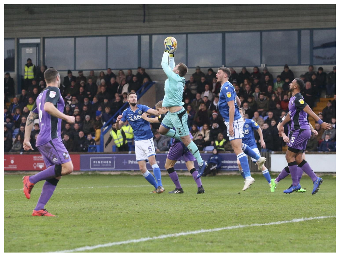
Match action in the goalless draw against Port Vale