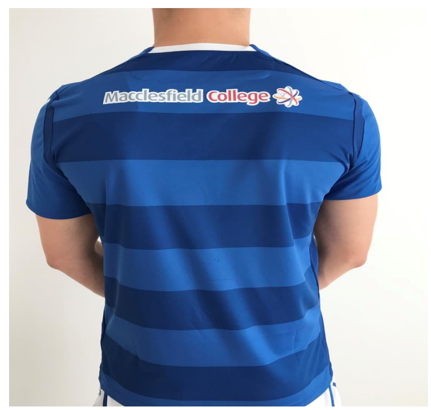
Home Shirt Back