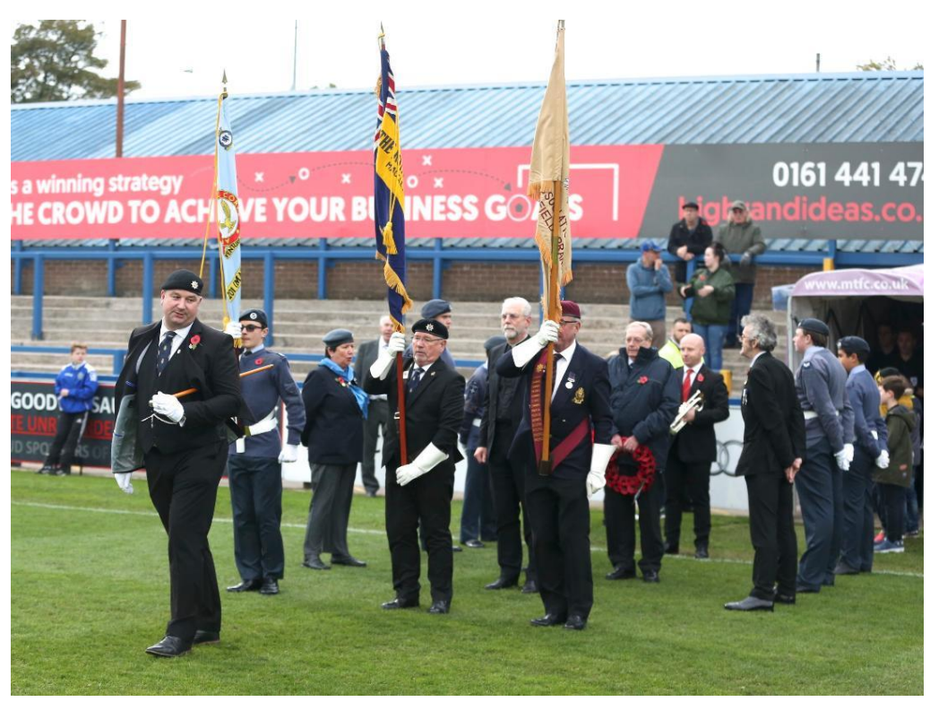
Members of the British Legion leading out the players before the match on 3 November