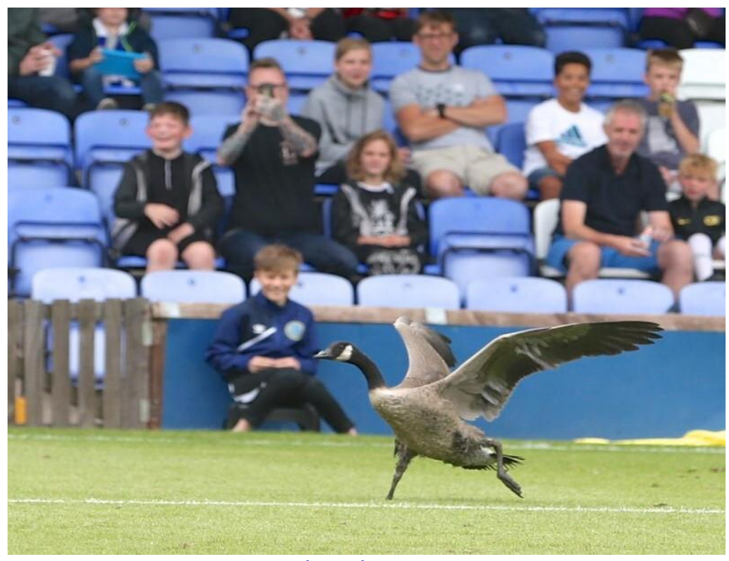
Intruder at the Moss Rose