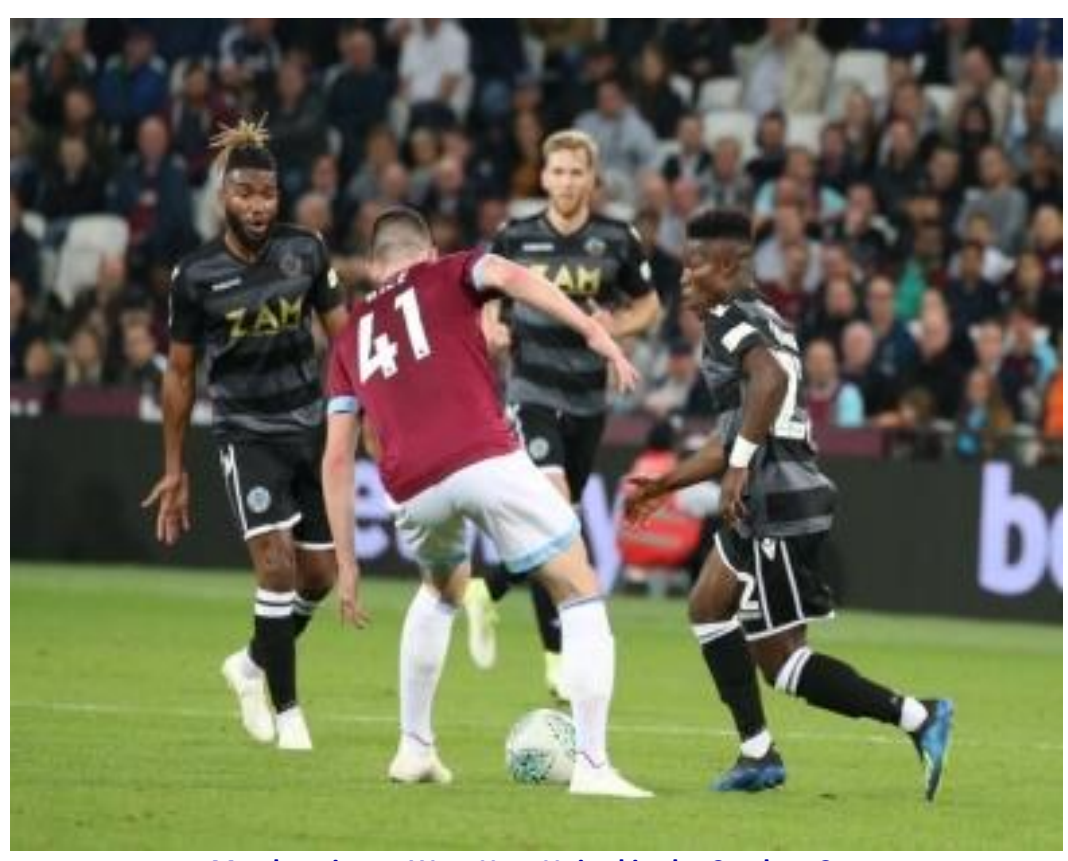
Match action at West Ham United in the Carabao Cup