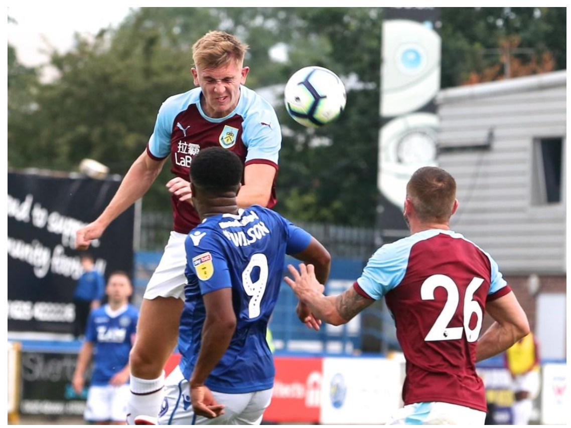
Match action against Burnley