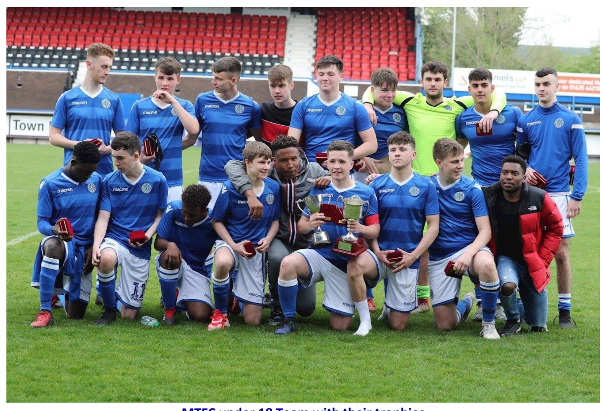
MTFC under 18 Team with their trophies