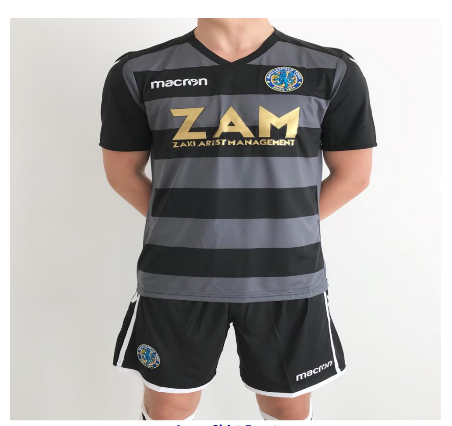
Away Shirt Front