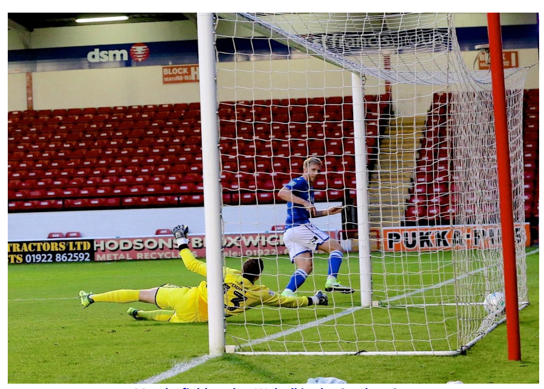
Macclesfield goal at Walsall in the Carabao Cup

The Central League Cup is a competition for Reserve teams together with a few EFL clubs who do not have a reserve team who are invited to participate. Macclesfield were drawn with Morecambe, Huddersfield Town and Fleetwood Town in the North Group. A 3-0 defeat at Morecambe was followed by a 4-3 victory at the Moss Rose against Huddersfield Town with the Group stage finishing with a home victory of 3-2 against Fleetwood Town . Macclesfield finished the Group stage in second position on goal difference to Fleetwood Town who progressed to the knock-out stage.