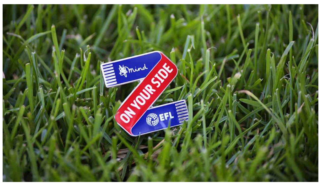
The English Football League MIND Badge