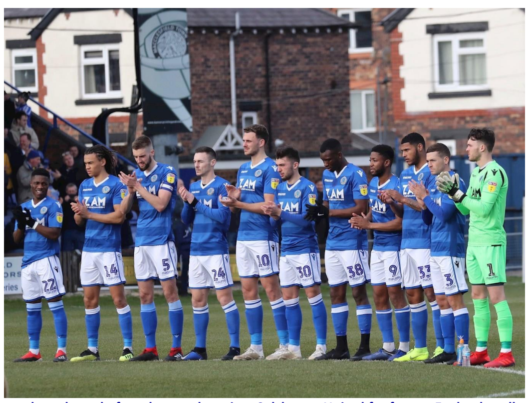
Pre-match applause before the match against Colchester United for former England goalkeeper Gordon Banks who had recently died