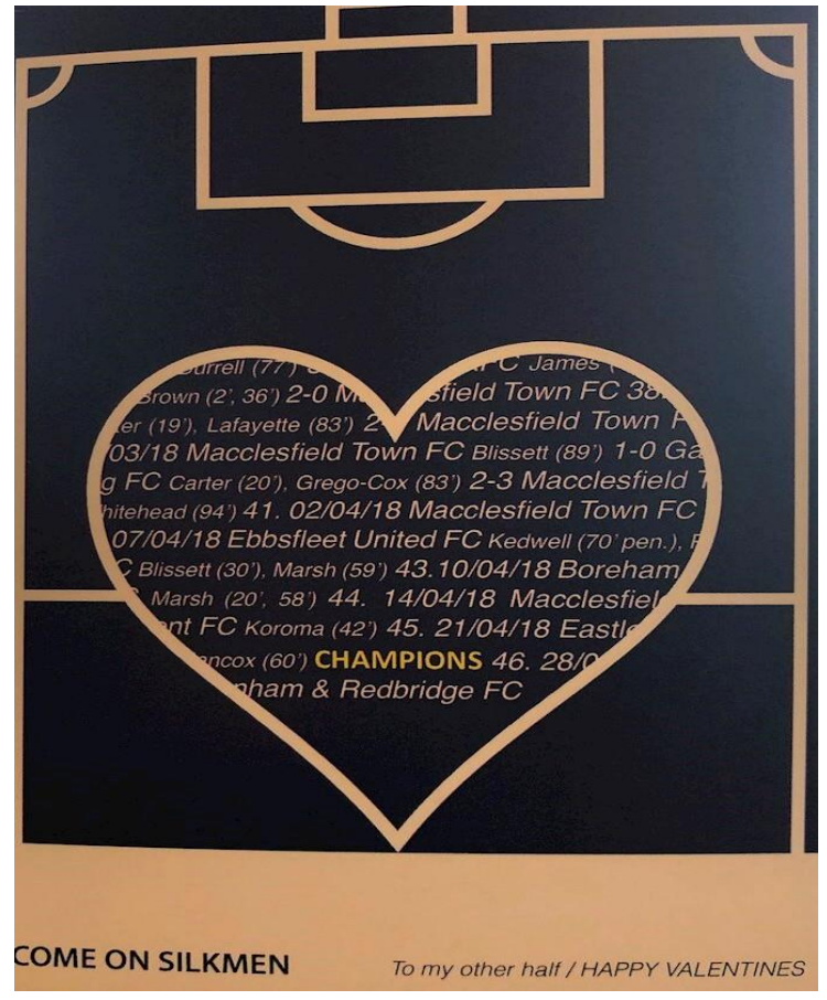
Special Valentine Card