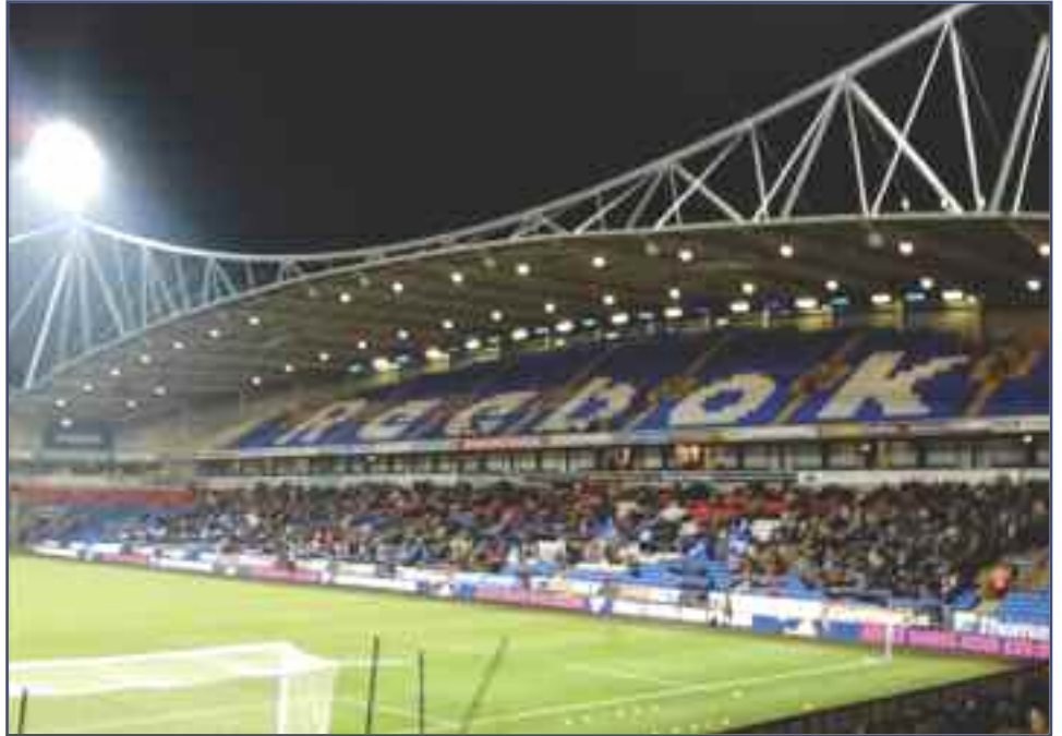
The Reebok Stadium – home of Bolton Wanderers